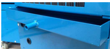
FR40 - Removable drip tray