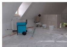
Ideal for decorators