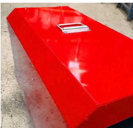
Contoured stylish design