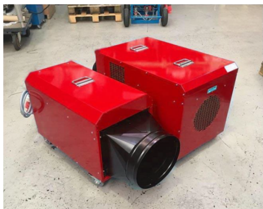
FHHT18 compared to the FHE29